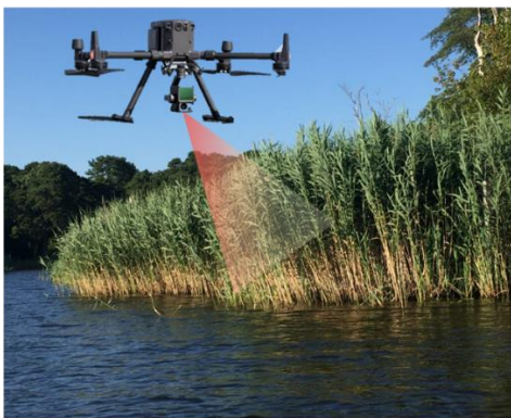
Drone with RGB-Multispectral + LiDAR sensor

We are looking for an enthusiastic graduate student to join an innovative project for Roseau Cane monitoring in the lower Mississippi River Delta. This project uses advanced remote sensing techniques to support restoration efforts. It also explores the application of machine learning for automated detection and counting of Roseau Cane Scale, an invasive species affecting P. australis , using remote imagery. By integrating remote sensing, machine learning, and entomology, the project wants to improve species management in aquatic environments. The selected student will work alongside a diverse team of experts in entomology, ecology, and remote sensing at Louisiana State University.